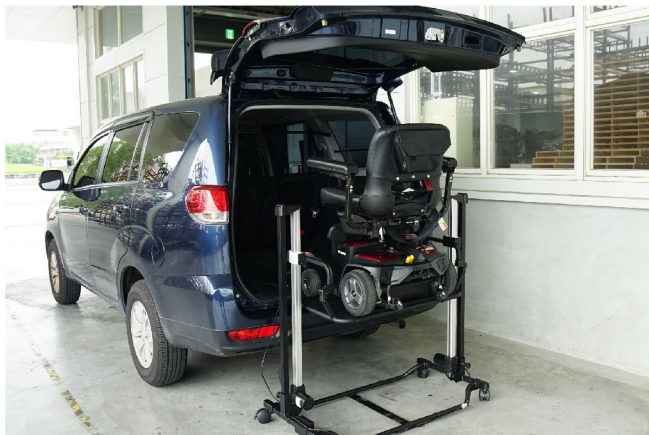
It's Portable. Fits in the truck and SUV. (no need to attach to the vehicle)