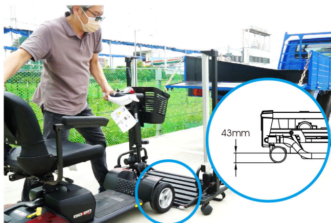
The distance from the platform to the ground is only 43mm. Can move the mobility aid on directly, no need to lift highly.