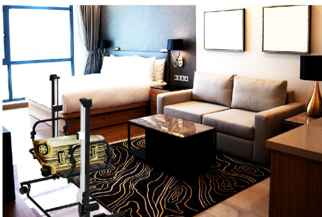
Replace the luggage rack in the hotel, it's convenient to pack the luggage anywhere in the room.