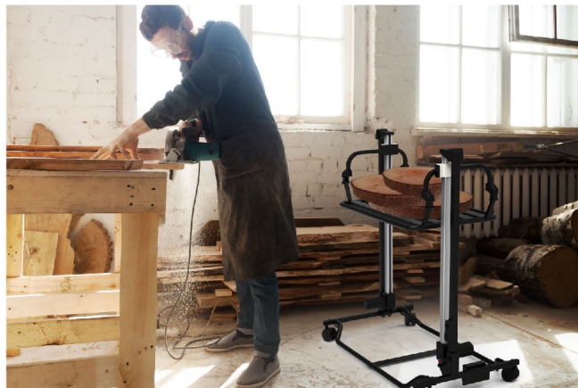
Household, lift the stuff on the shelf, table, or other higher places at the workplace.